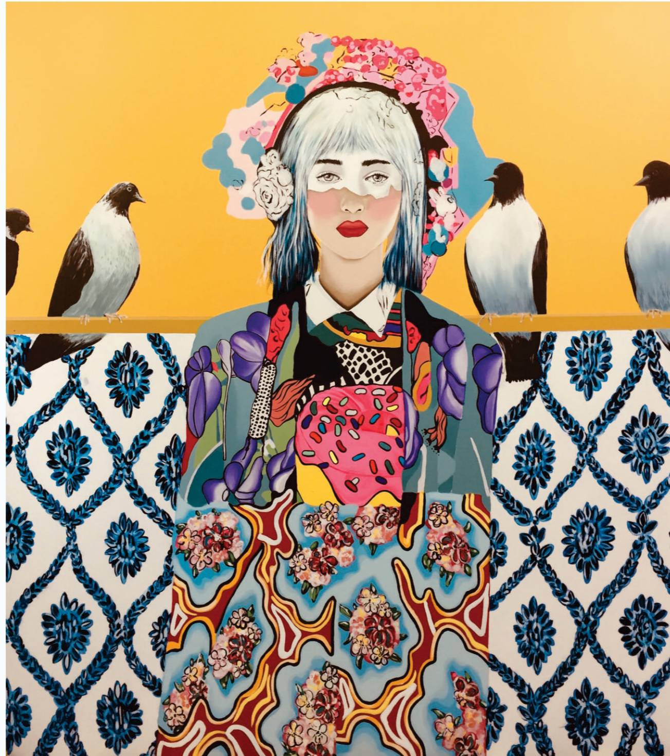
Moi et moi | Acrylic on Canvas | 210 x 190 cm | 2016