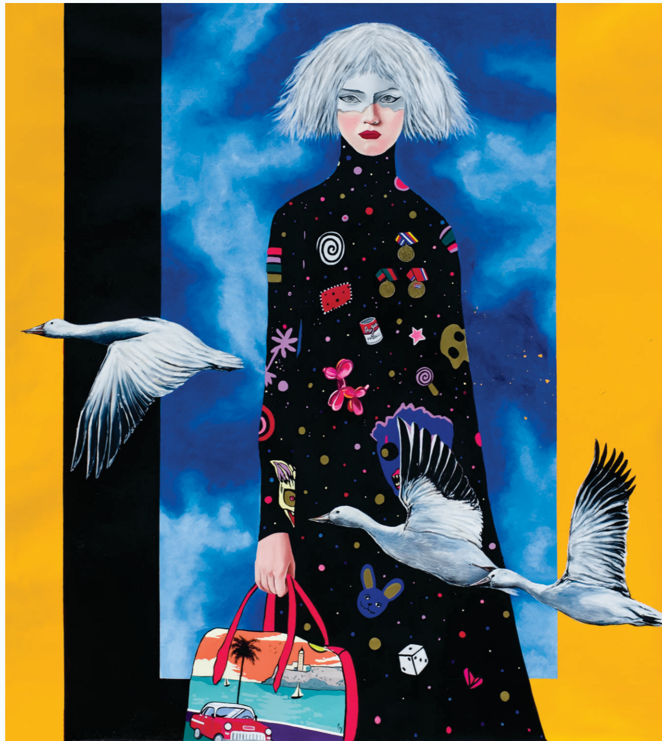
Fly Cuba | Acrylic on Canvas | 200x170 cm | 2017