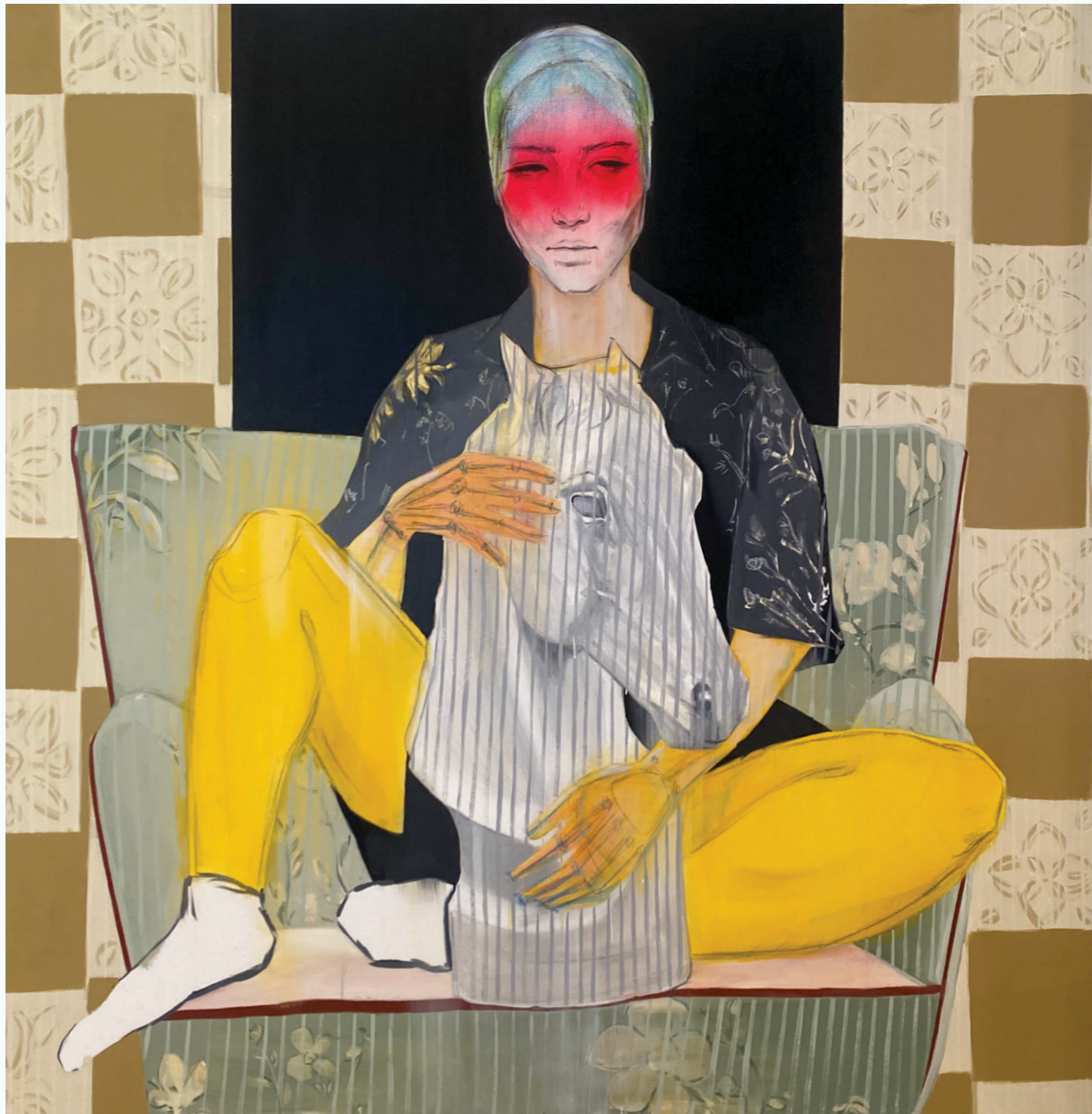
Karma | Acrylic on Canvas | 160x156 cm | 2021