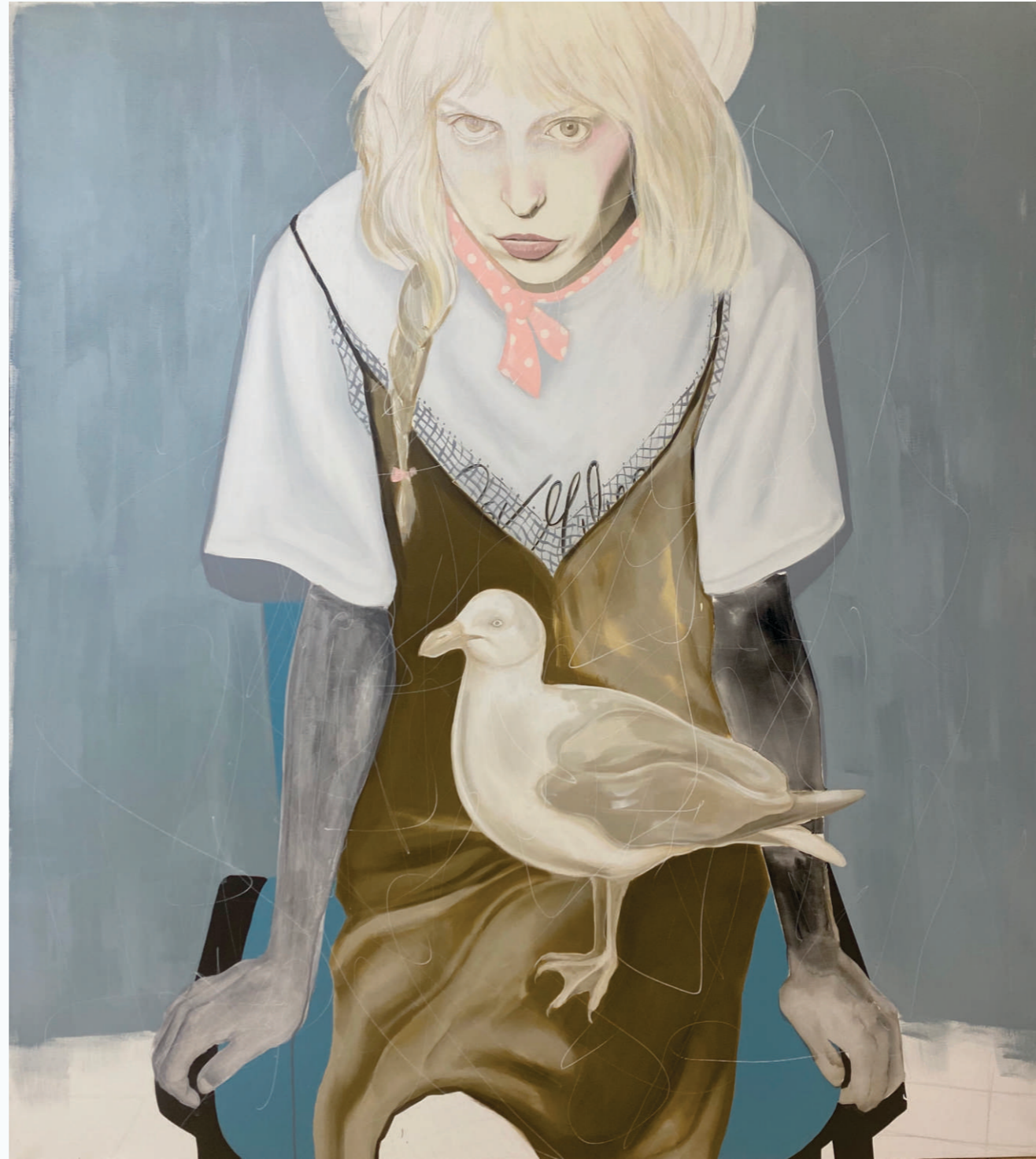
Lilith | Acrylic on Canvas | 180x160 cm | 2021