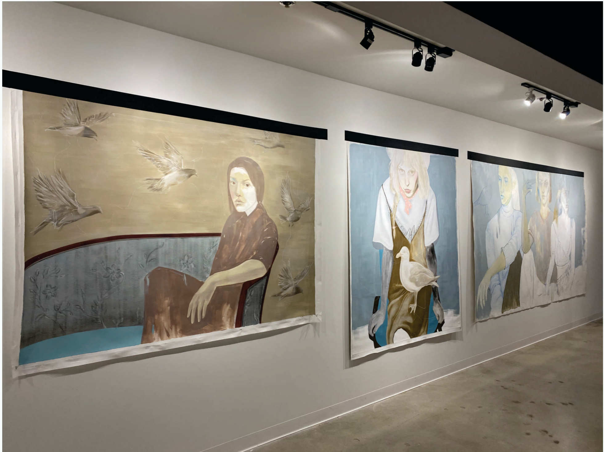
The Gallery Lounge | Boca Raton | 2021