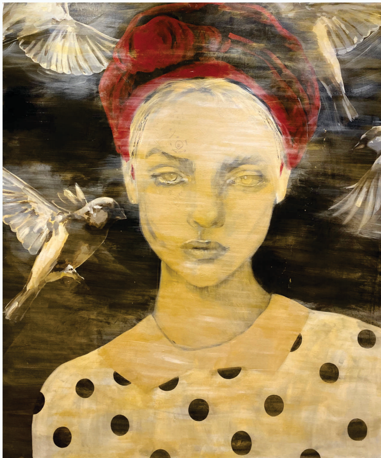
La Maga | Acrylic on Canvas | 200x170 cm | 2020