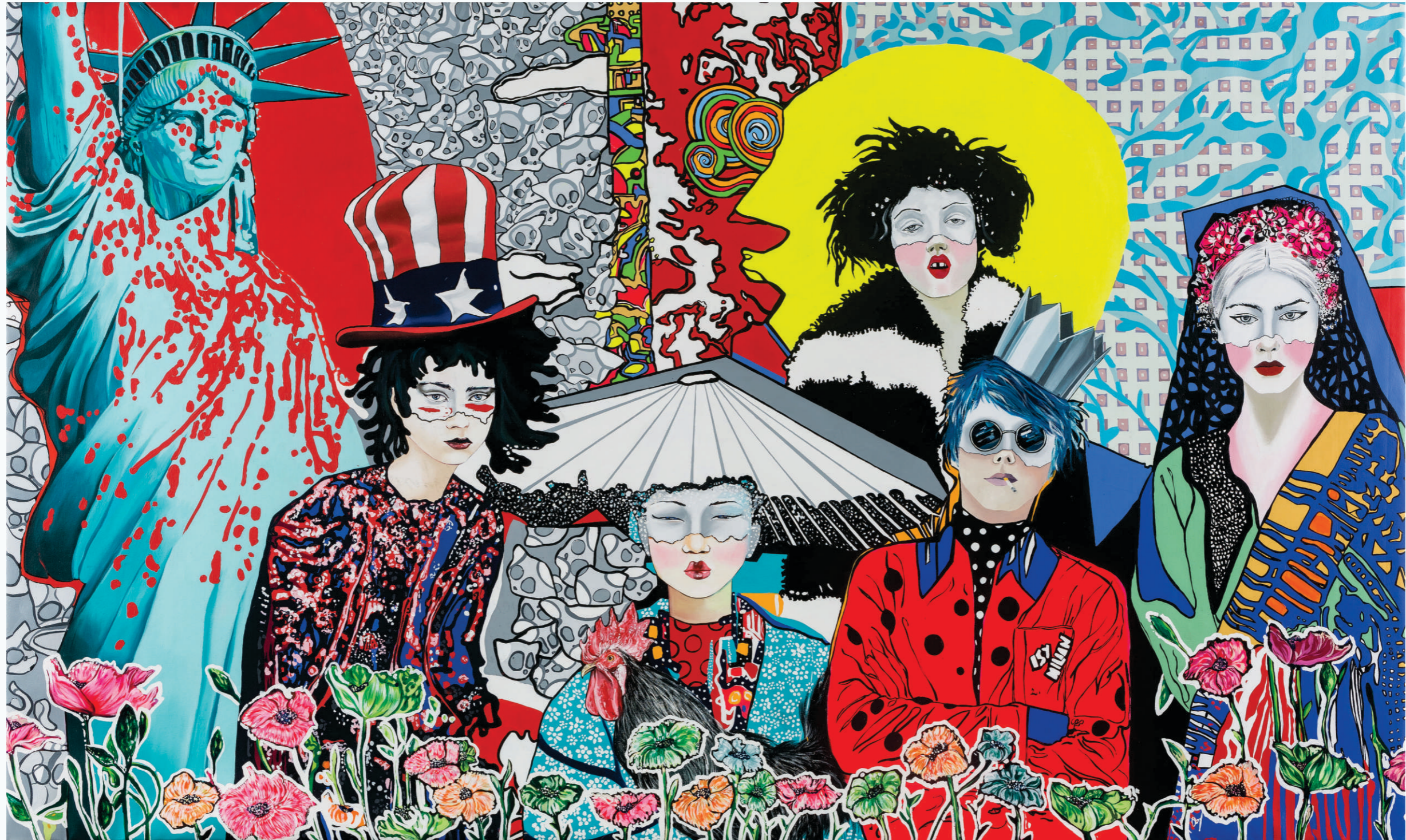
Melange | Acrylic on Canvas | 170 x 300 cm | 2018