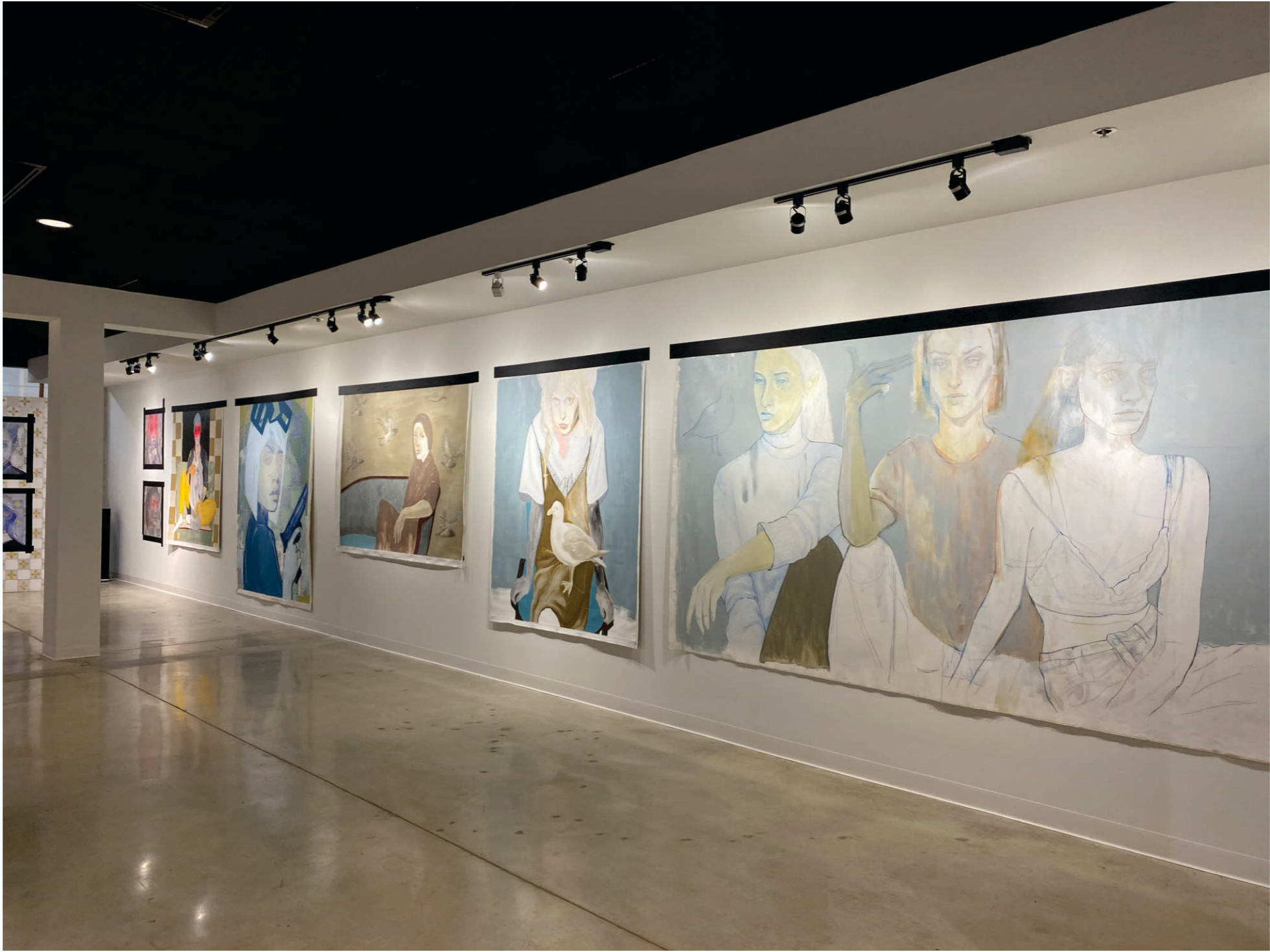
The Gallery Lounge | Boca Raton | 2021