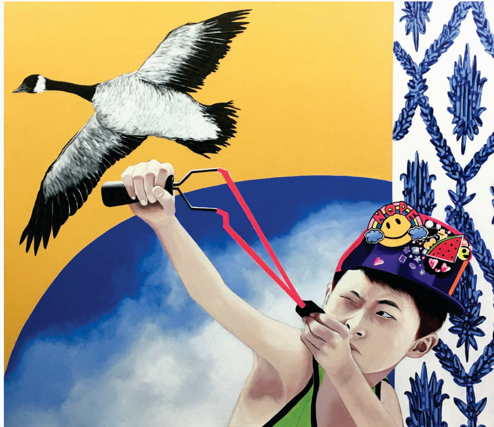
Obey | Acrylic on Canvas | 160x180 cm | 2017