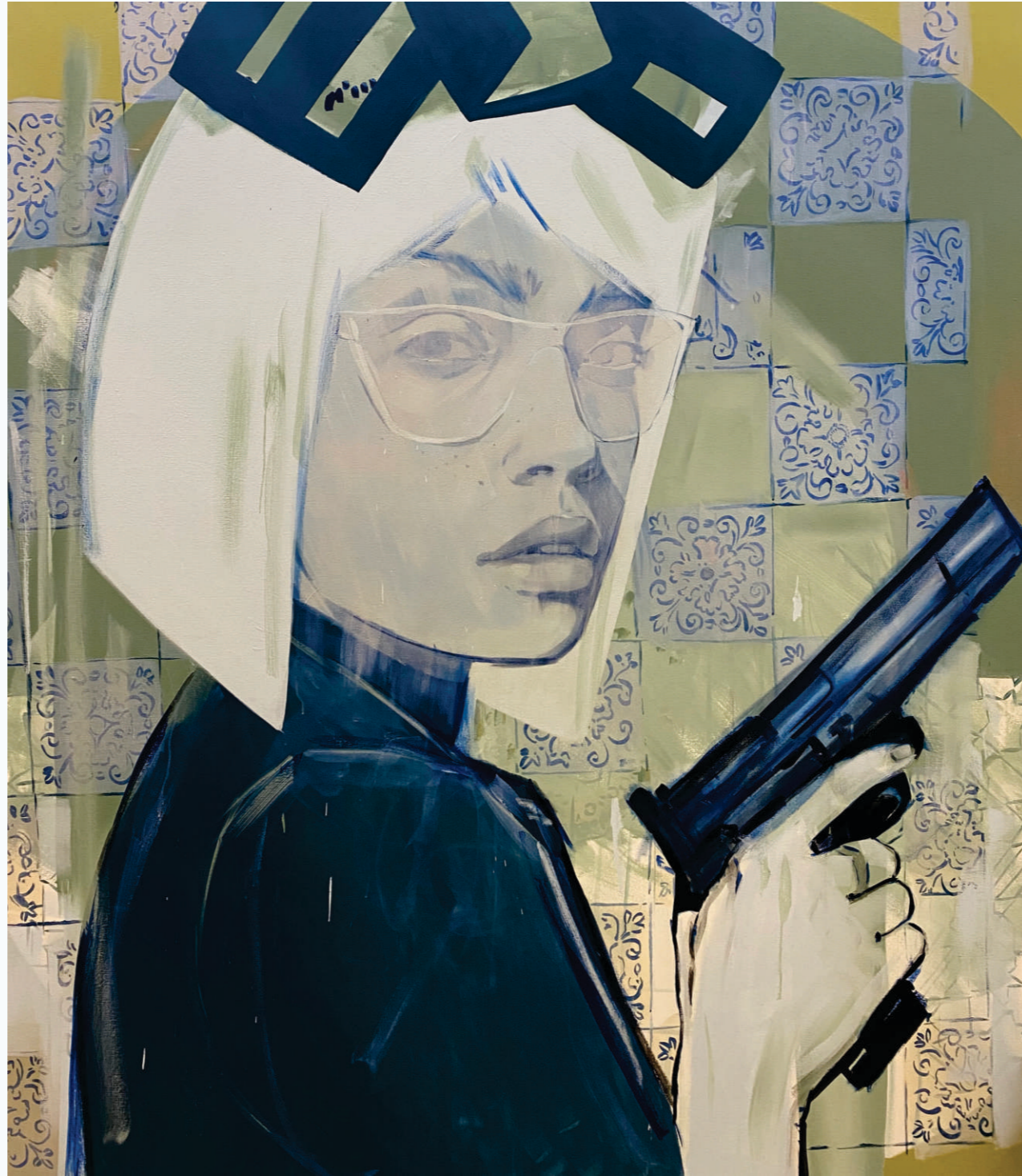
Koniec | Acrylic on Canvas | 200x170 cm | 2020