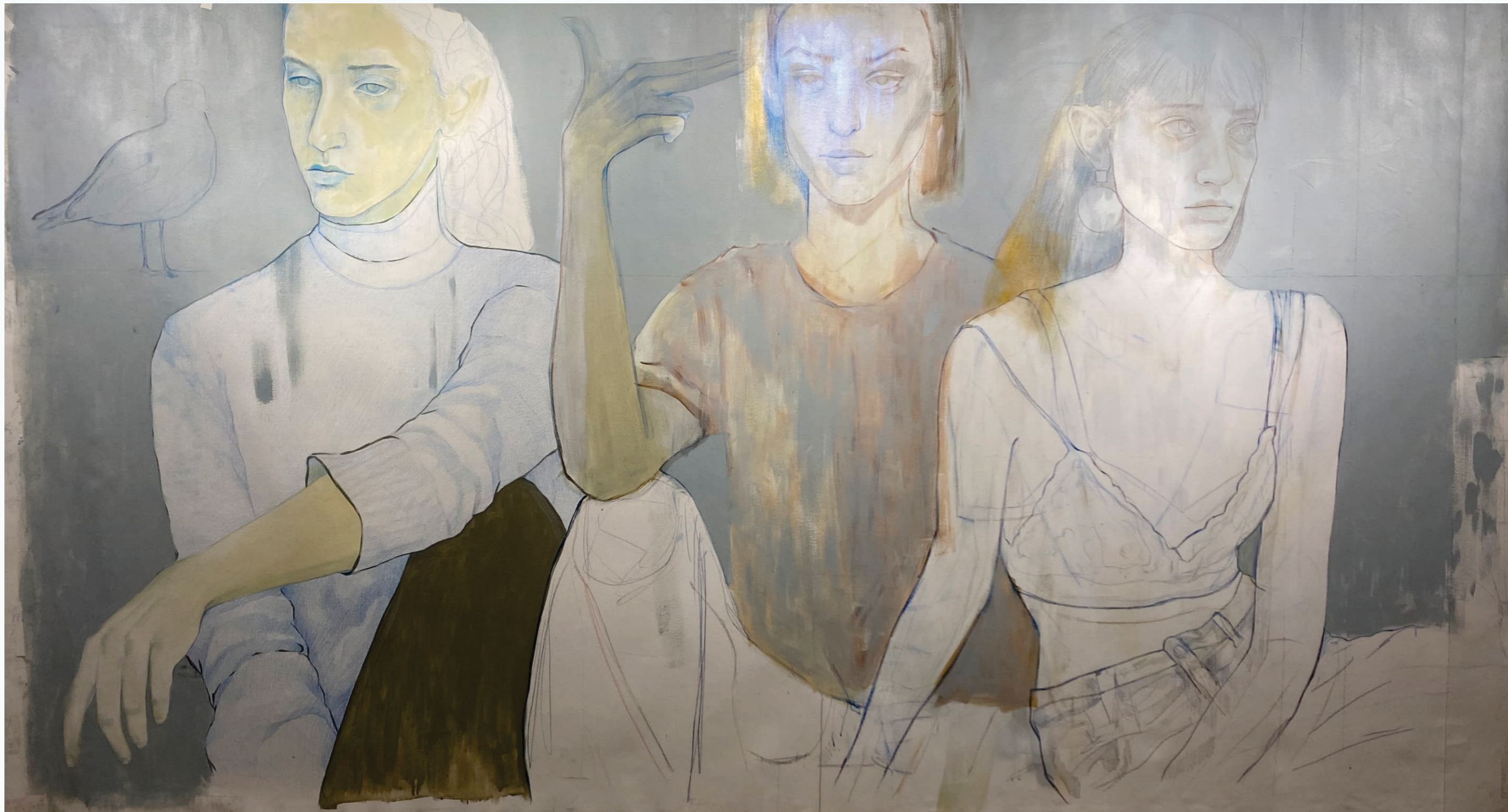
Las comprometidas | Acrylic on Canvas | 170x320 cm | 2021