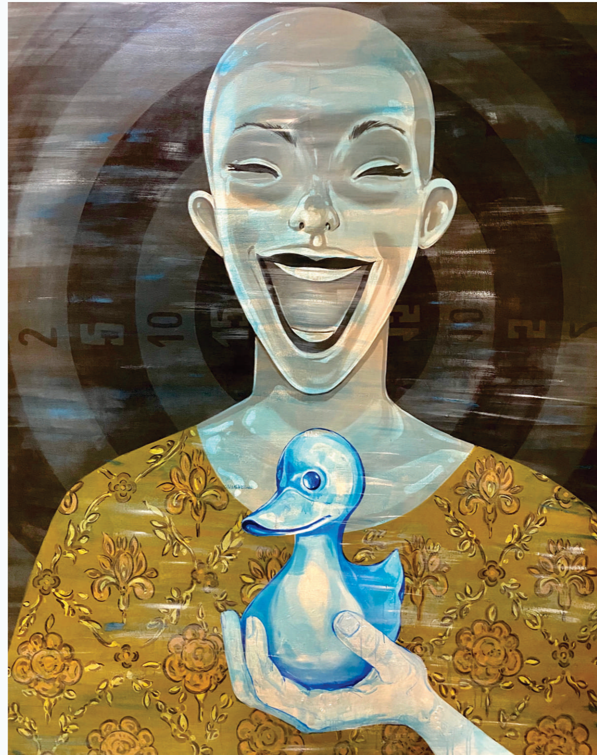
Olimpo | Acrylic on Canvas | 200x170 cm | 2020