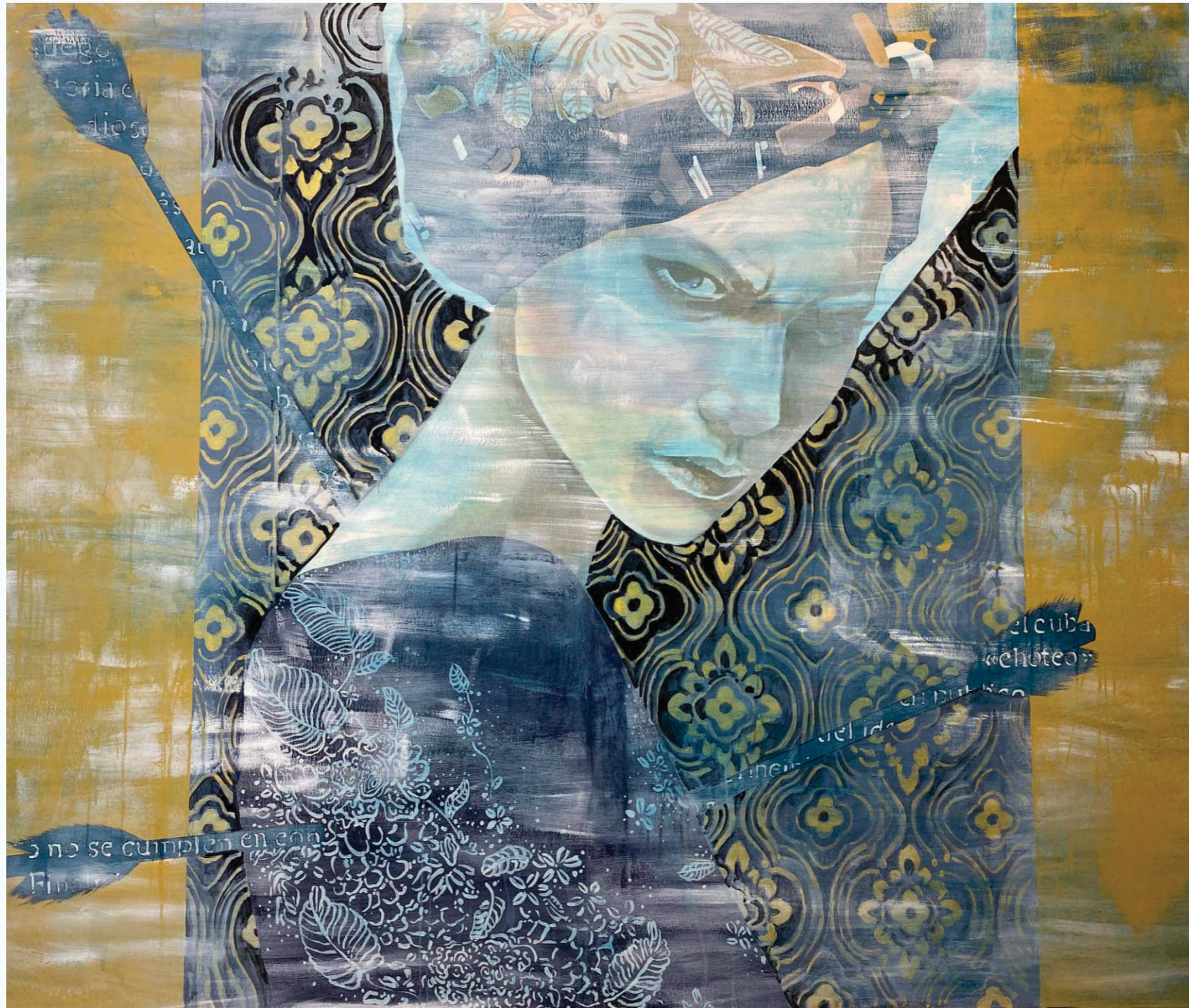
Havana | Acrylic on Canvas | 170x200 cm | 2020