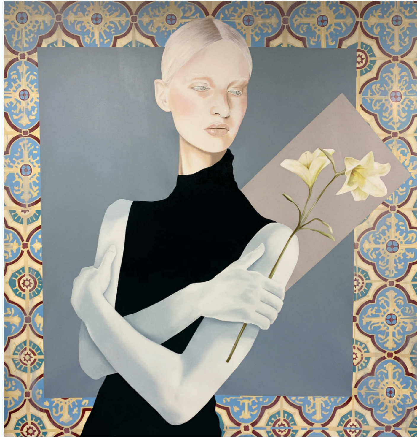
Good News | Acrylic on Canvas | 230x210 cm | 2021