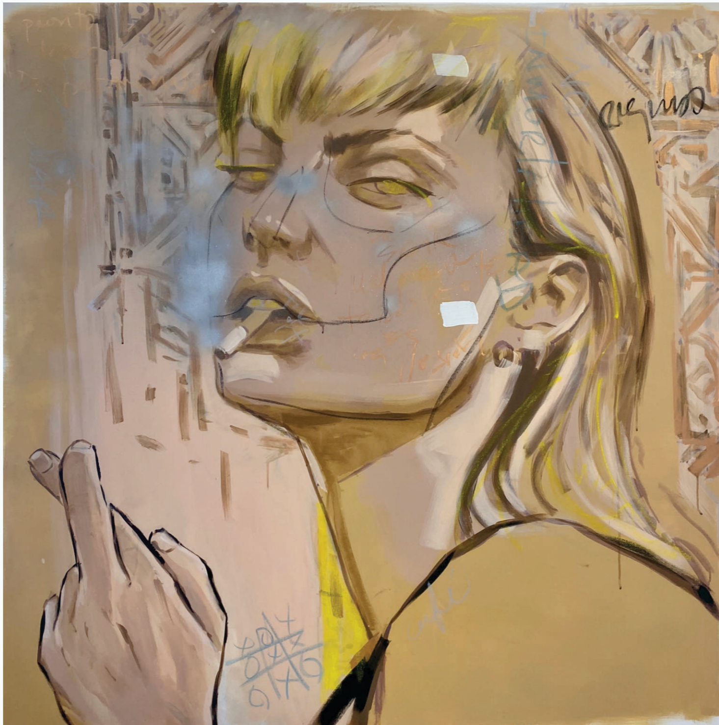
Tere | Acrylic on Canvas | 140x140 cm | 2020