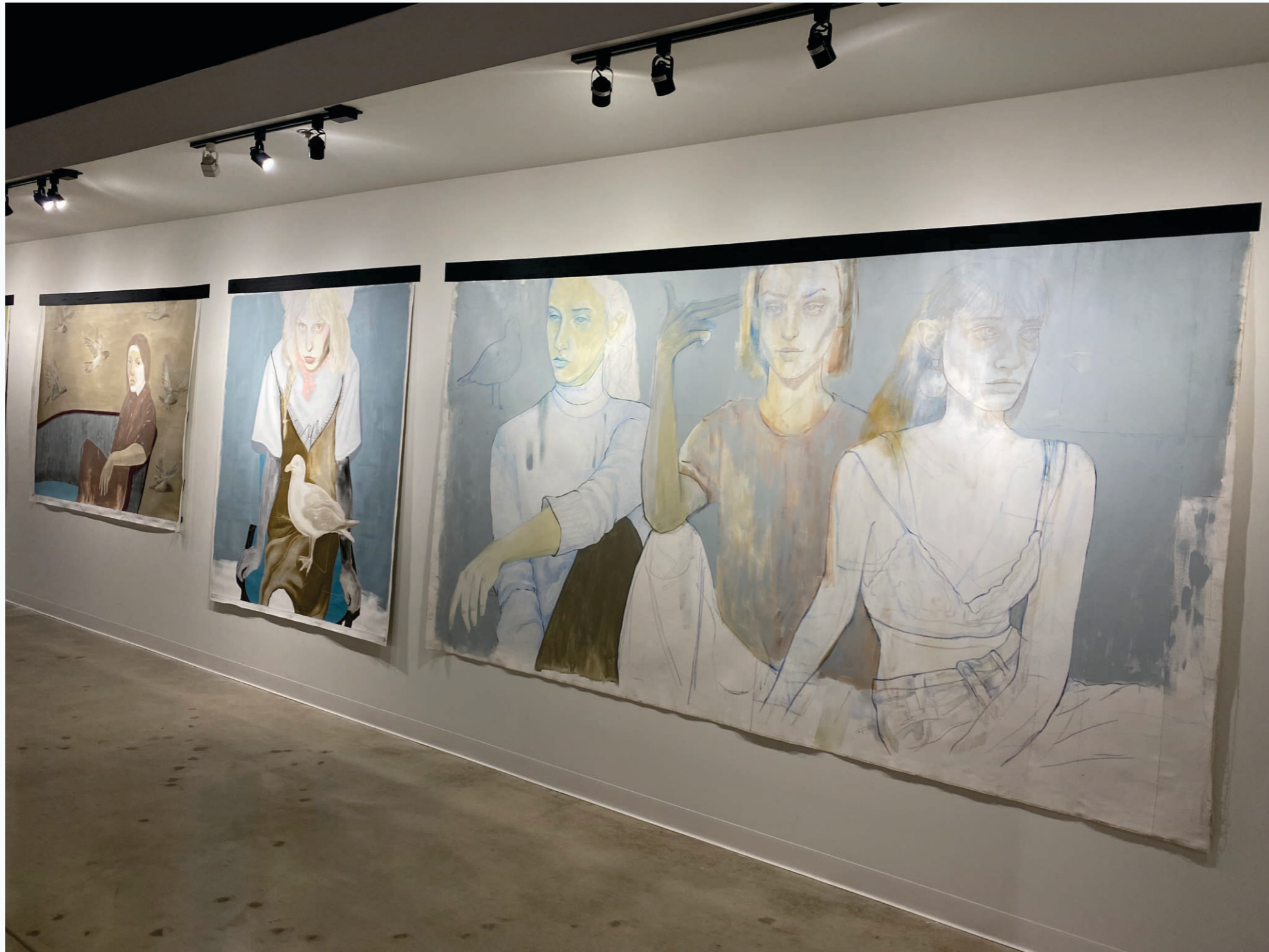
The Gallery Lounge | Boca Raton | 2021