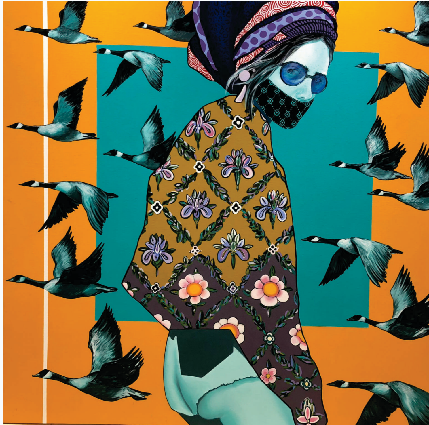
Escape | Acrylic on Canvas | 156x160 cm | 2018