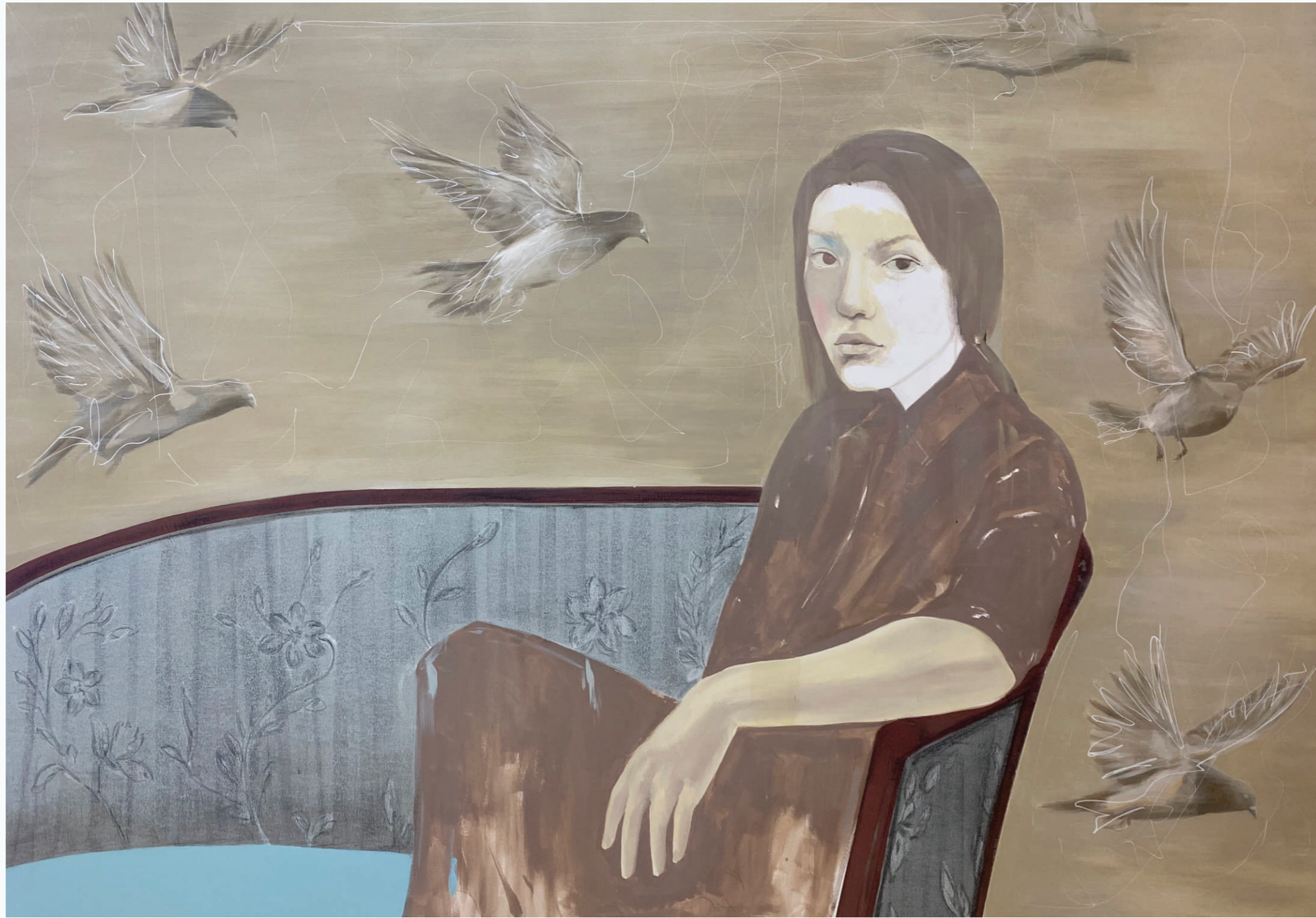
El sofá | Acrylic on Canvas | 140x200 cm | 2021